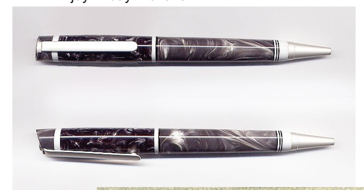
Enjoy! Jay Pickens

I'm sure I've left out some things, but hopefully a view of some of the finished pens might really clear things up. Again, this isn't hard - it just might be something new for you. Give it a try - you might just find that doing something unusual might just make you stand out a bit more than those that wont budge from their Euros or Slimlines.