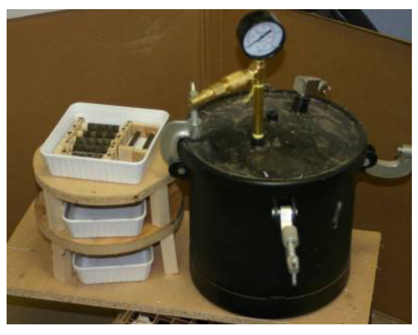
Here is the rack system and the tank — side by side.

Also pictured are the two racks I use so I can cast two molds full of tubes at once. The bottom of the tank is concave and I place a round plywood disk in the bottom. This holds one mold; the second mold is placed on the next layer. I use a top plywood disk to keep the air from the compressor from blowing out the resin, although it may not be needed.