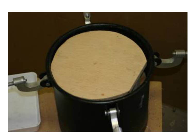
Racks and molds are in the tank. It is time for the lid and pressure.