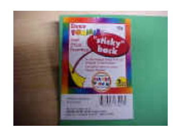
Self stick, hobby foam is used for the compressive seal on the working end.