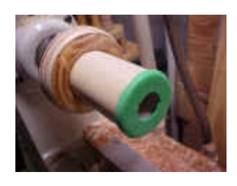
Okay so it's a real work of art... but will it hold anything?