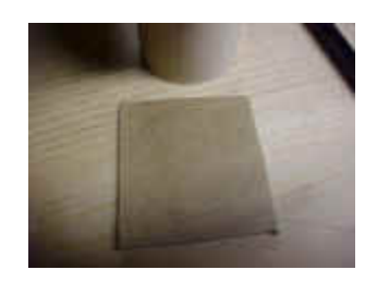
A piece of foam is cut and the diameter of the tube is traced on the backing.