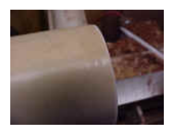
And here is the minimum. I can't say what the out of round was but its true now.