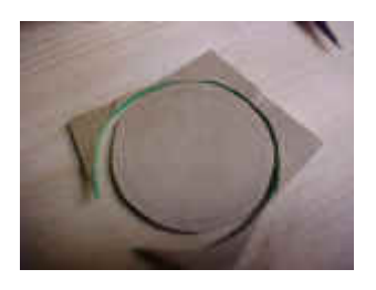
The foam is trimmed with scissors leaving some excess to "roll over" the edge.