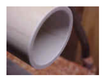
The inside and outside corners are broken by scraping with the edge of a skew.