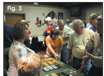
Some of the over one hundred attendees at the Rendezvous.