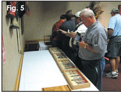
Fig. 5 People voted for their favorite pens in several different categories.