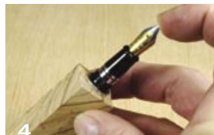
Dry-fit the pen parts to test the drill depth.

You need to mark the end of the internal brass tube and make sure you leave sufficient wood at that spot for strength. I like to leave around 0.040" so the diameter needs to be no less than 0.550".