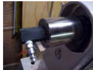
The vacuum coupling is installed and the vacuum pump hose is attached and the pump is turned on.