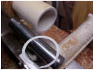
A skew is used to cut a square and flat face on the end of the PVC tube.