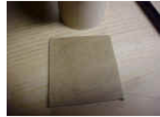
A piece of foam is cut and the diameter of the tube is traced on the backing.