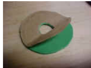
The protective backing is removed.