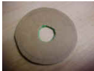
The center hole is cut. The size is unimportant so quite a bit of foam is left on the id.