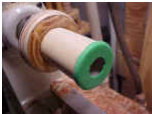
Okay so it's a real work of art... but will it hold anything?