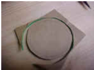
The foam is trimmed with scissors leaving some excess to "roll over" the edge.