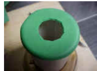
The compressive foam is stuck to the end of the vacuum chuck.