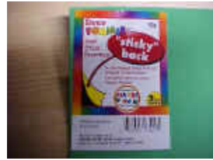
Self stick, hobby foam is used for the compressive seal on the working end.