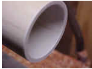
The inside and outside corners are broken by scraping with the edge of a skew.